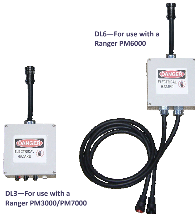
DL3—For use with a Ranger PM3000/PM7000

Note: * units come with 4 banana to banana for voltage connections and 3 BNC to BNC for current connection